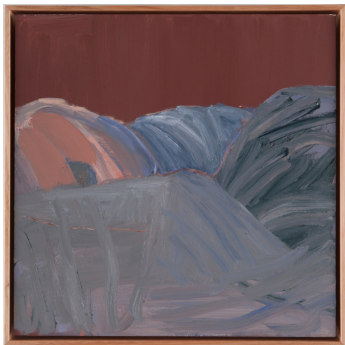
Kathryn Dolby From Hill To Hill , 2020 acrylic on board 33 x 33 cm Tasmanian Oak Frame $850