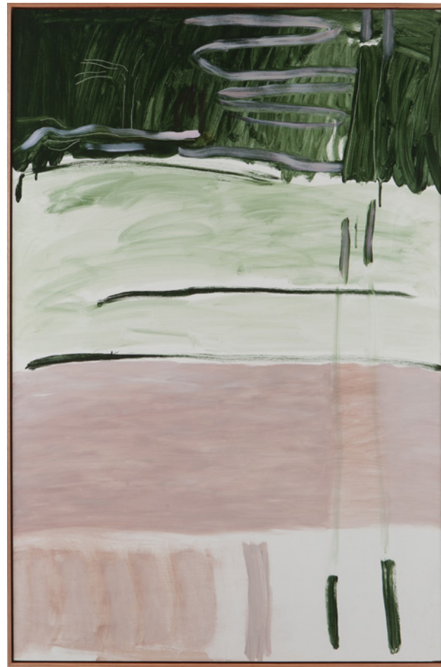
Kathryn Dolby Rain Ribbon , 2020 acrylic on board 123 x 83 cm Tasmanian Oak Frame $3,200