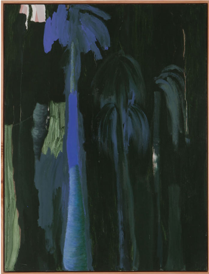
Kathryn Dolby Water Vessel (Moringa Drouhardii) , 2020 acrylic on board 83 x 63 cm Tasmanian Oak Frame $2,100