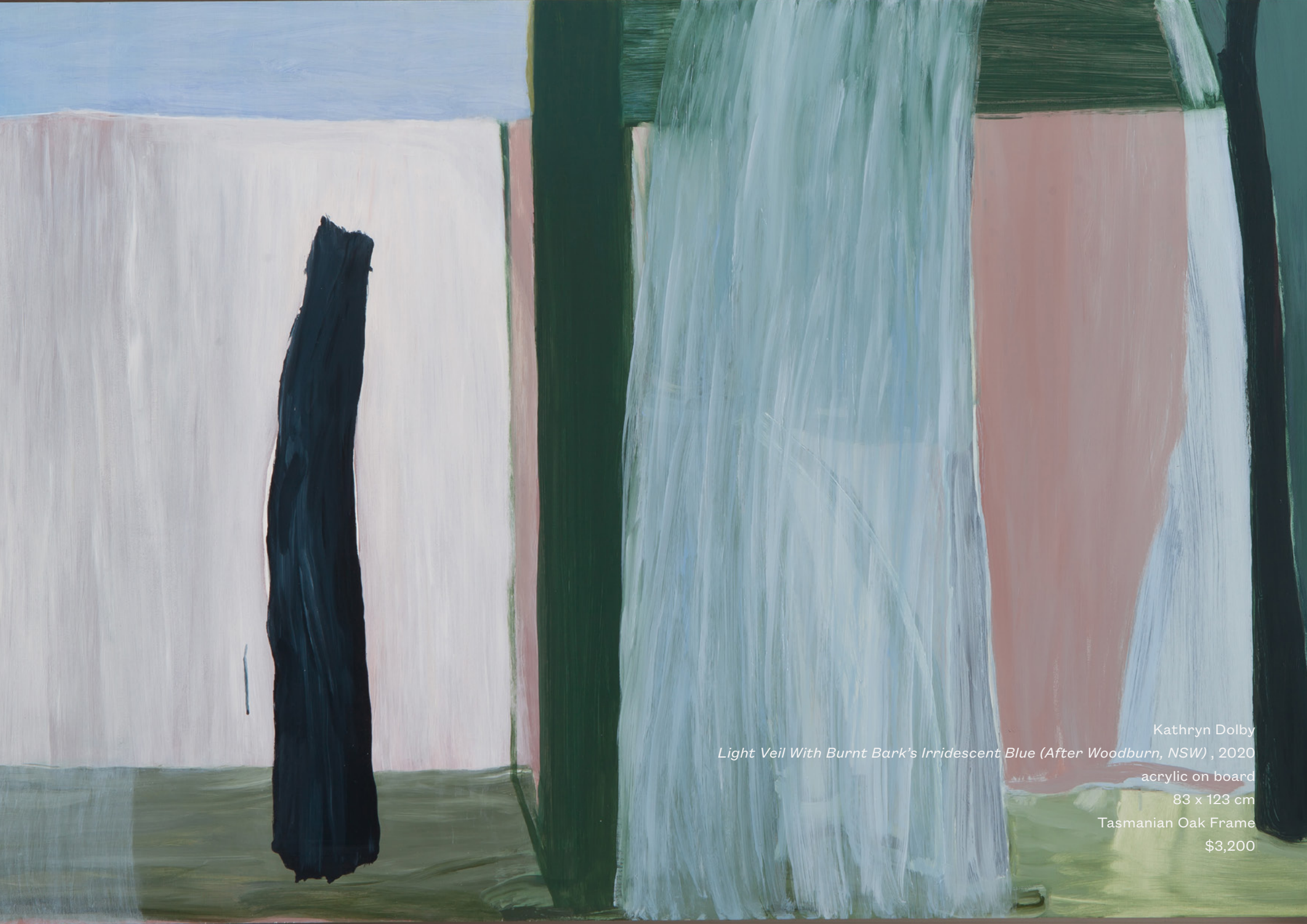
Kathryn Dolby Light Veil With Burnt Bark's Irridescent Blue (After Woodburn, NSW) , 2020 acrylic on board 83 x 123 cm Tasmanian Oak Frame $3,200