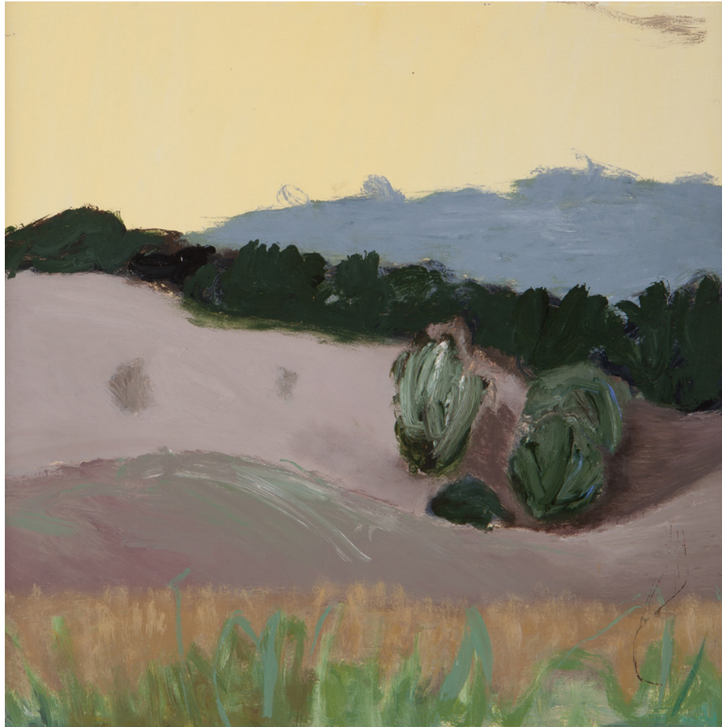
Kathryn Dolby Light Haze , 2020 acrylic on board 33 x 33 cm Tasmanian Oak Frame $850