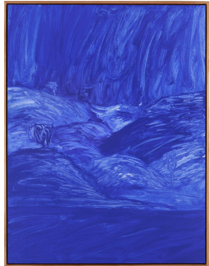
Kathryn Dolby Mallanganee Monochrome , 2020 acrylic on board 83 x 63 cm Tasmanian Oak Frame $2,100