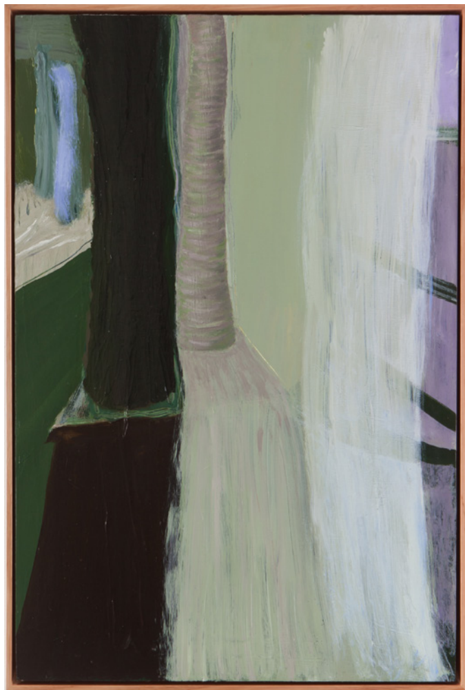
Kathryn Dolby Bringing The Outside In , 2020 acrylic on board 63 x 43 cm Tasmanian Oak Frame $1,250