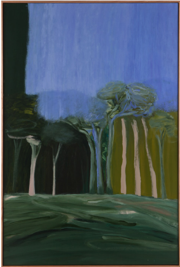
Kathryn Dolby Lilac Deluge , 2020 acrylic on board 123 x 83 cm Tasmanian Oak Frame $3,200