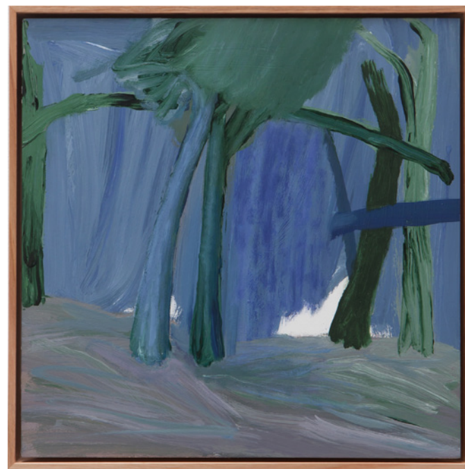
Kathryn Dolby Leaning Limbs , 2020 acrylic on board 33 x 33 cm Tasmanian Oak Frame $850