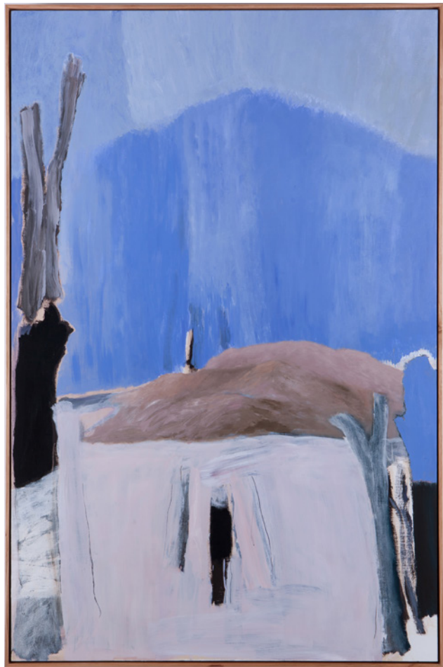
Kathryn Dolby Drought, Fire, Rain 2020 acrylic on board 123 x 83 cm Tasmanian Oak Frame $3,200